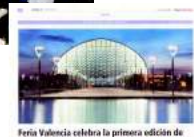
Feria Valencia celebra la primera edición de